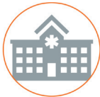
Place of Birth