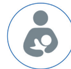
Maternal Breast Milk

Statement on Inclusive Language and Practice. The North West Neonatal Operational Delivery Network (NWNODN) and the North West Coast and Greater Manchester Safety Patient Collaboratives are aware that the use of gendered language such as mother, woman and maternal, as well as breast and breastmilk feeding, can make some families feel excluded. When we use these words in this document, we are referring to all birthing people and parents, regardless of their gender identity. When supporting individual families, professionals are encouraged to use the terms that the family identifies with, as well as their desired pronouns.