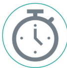
Optimal Cord Management